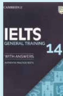
Cambridge IELTS 14 General Training