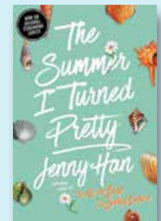
The Summer I Turned Pretty