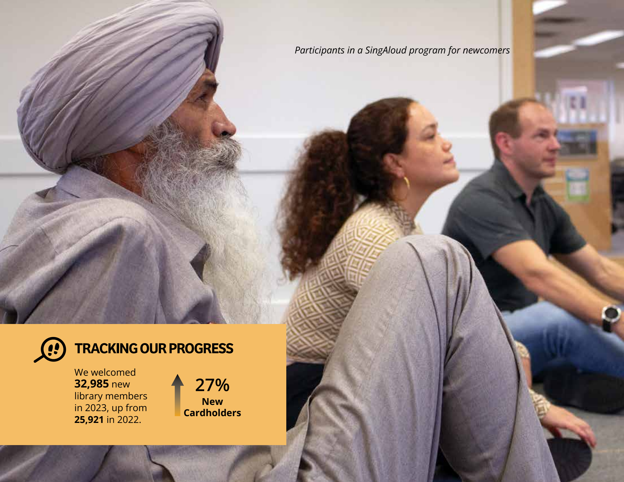
Participants in a SingAloud program for newcomers