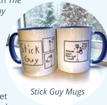
Stick Guy Mugs