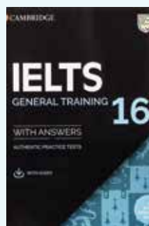
CAMBRIDGE IELTS 16 GENERAL TRAINING