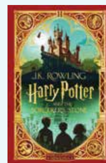
HARRY POTTER AND THE SORCERER'S STONE