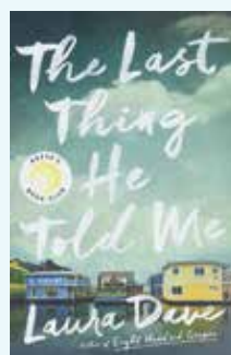
THE LAST THING HE TOLD ME