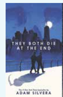
THEY BOTH DIE AT THE END

I spend a lot of time in my vehicle. Borrowing audiobooks and MP3s from Surrey Libraries allows me to get a university education every couple years.