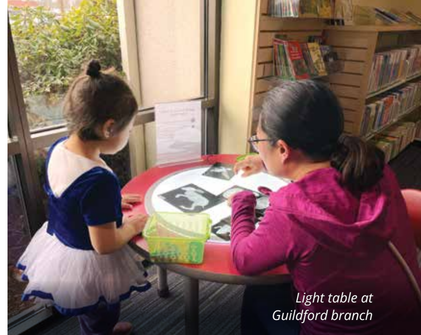
Light table at Guildford branch